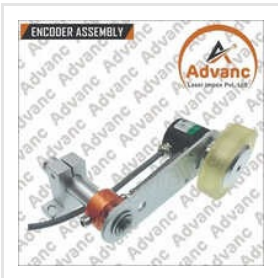
Encoder Wheel Assembly