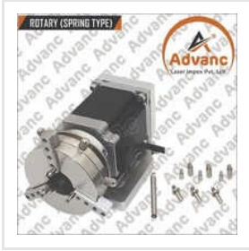
Laser Marking Spring Rotary