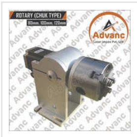
SS Marking Machine Rotary Device