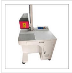
CO2 Metal Tube Laser Marking Machine