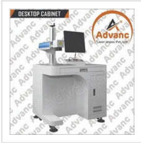
Fiber Laser Marking Machine