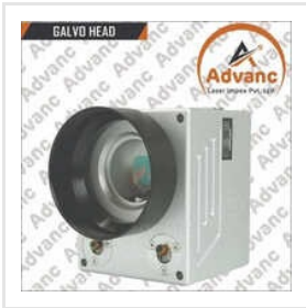
Laser Marking Machine Galvo Head