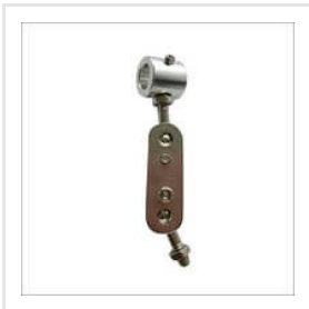
Laser Pointer Fixture