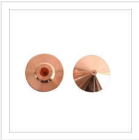
Metal Laser Cutting Machine Nozzle