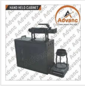
Handheld Laser Marking Machine