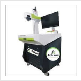
Co2 Laser Marking Machine