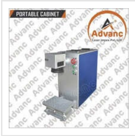
Portable Laser Marking Machine