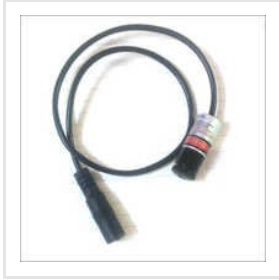
Red Beam Laser Light Pointer