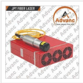
Fiber Laser Source