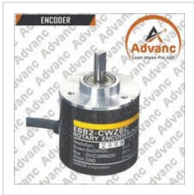
Magnetic Linear Encoder