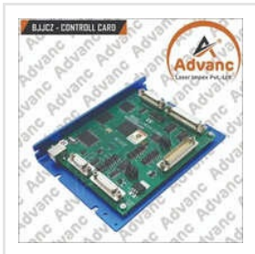
Laser Marking Control Card