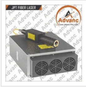
230 V Single Phase Optical Laser Source