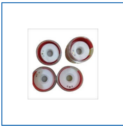
CERAMIC RING FOR LASER CUTTING MACHINE